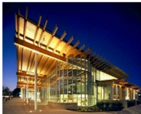
The Ballard Library in Seattle, WA is a state-of-the-art green building and listed as on of the American Institute of Architecture's top ten greenbuildings.